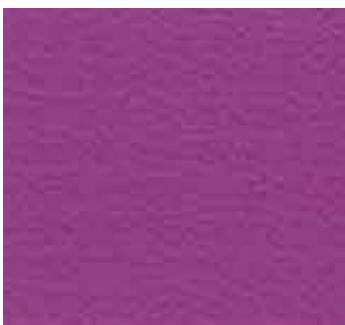
PANAMA PURPLE CP-2723 ITEM # 857223