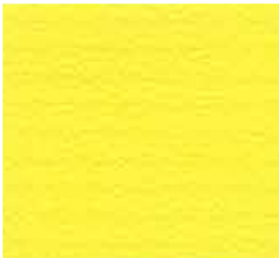
SUNRISE SAFFRON CP-2730 ITEM # 857230