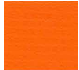
SUNSET ORANGE CP-2713 ITEM # 857213