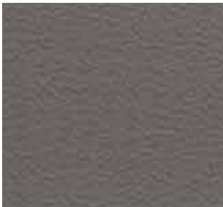
DARK TAUPE CP-2791 ITEM # 857891