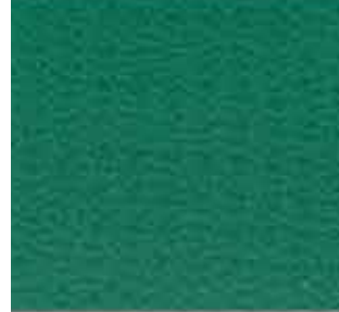
HARBOR GREEN CP-2701 ITEM # 857201