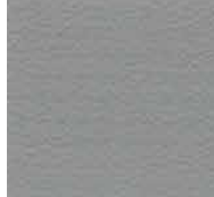
DRIFTWOOD GRAY CP-2719 ITEM # 857219