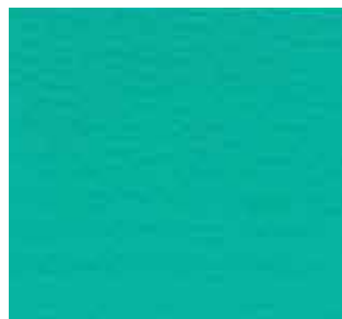
AQUAMARINE CP-2744 ITEM # 857244