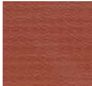
RUST CP-2709 ITEM # 857209