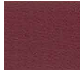
BURGUNDY CP-2715 ITEM # 857215