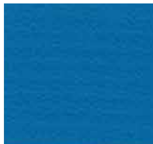
BAY BLUE CP-2741 ITEM # 857241