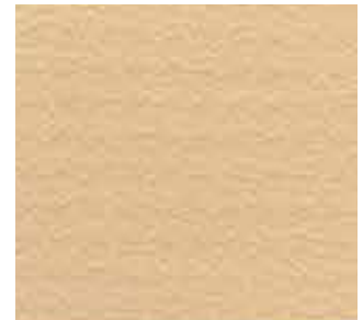
SAND CP-2700 ITEM # 857200