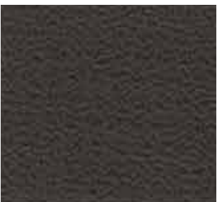
BARQUE BROWN CP-2725 ITEM # 857225