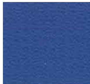
OCEAN BLUE CP-2746 ITEM # 857246