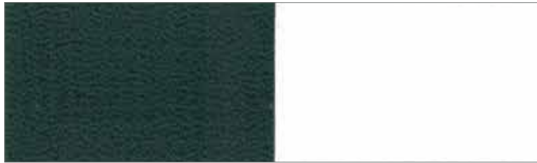
GLADE GREEN CP-2751 ITEM # 857251