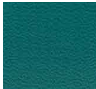
TROPIC GREEN CP-2742 ITEM # 857242