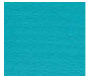
ISLAND TURQUOISE CP-2704 ITEM # 857204