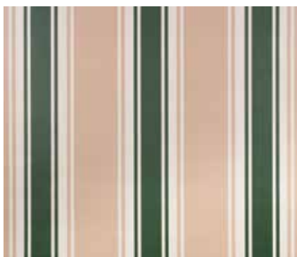
SAND/IVORY/OLIVE WITH IVORY CP-2882 †