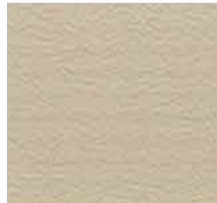
EBBTIDE TAN CP-2738 ITEM # 857238