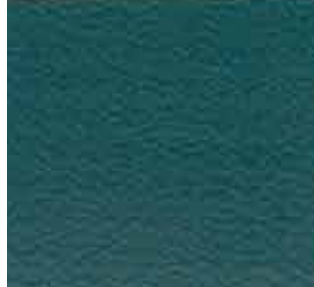
TEAL CP-2743 ITEM # 857243