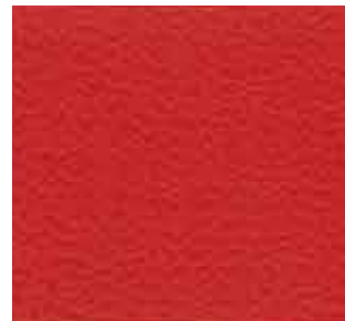
DEEP RED CP-2726 ITEM # 857226