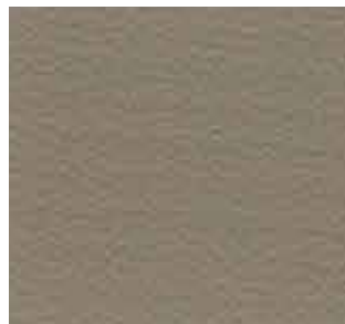
BEIGE CP-2792 ITEM # 857892