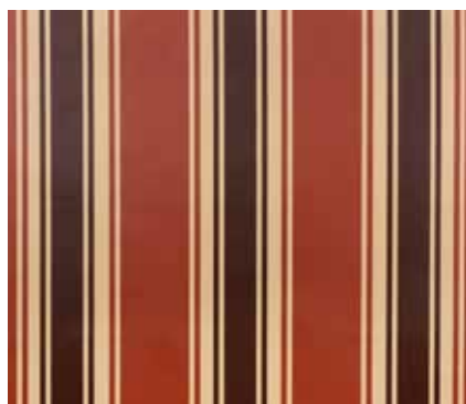
RUST/SAND/DARK BROWN WITH SAND CP-2887 †