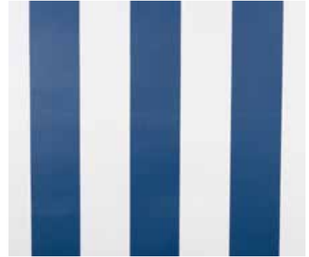
DEEP SEA BLUE AND WHITE/WHITE CP-2772 *