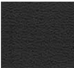
PIRATE BLACK CP-2745 ITEM # 857245