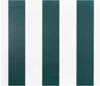
GLADE GREEN AND WHITE/WHITE CP-2761 *