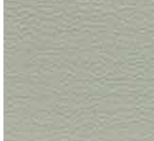
GULL GRAY CP-2717 ITEM # 857217