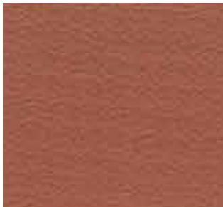
TERRA COTTA CP-2796 ITEM # 857896