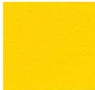
BEACON YELLOW CP-2706 ITEM # 857206