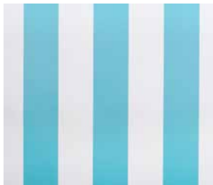
TURQUOISE AND WHITE/WHITE CP-2774 *