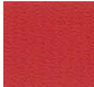
PORTLIGHT RED CP-2707 ITEM # 857207