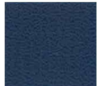
DEESEA BLUE CP-2712 ITEM # 857212