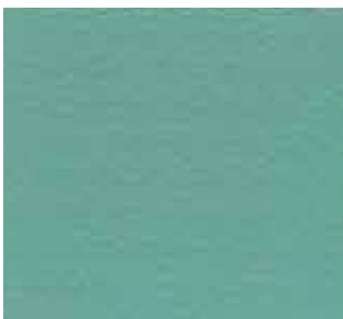
JADE CP-2734 ITEM # 857234