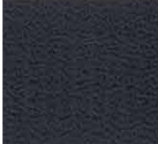
NAVY BLUE CP-2747 ITEM # 857247