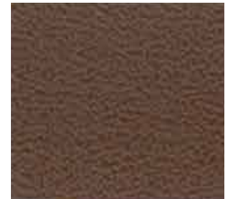
CORK BROWN CP-2705 ITEM # 857205