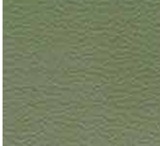
SEA PALM CP-2702 ITEM # 857202