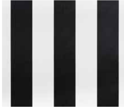
PIRATE BLACK AND WHITE/WHITE CP-2770 *