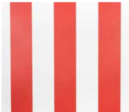
BRITE RED AND WHITE/WHITE CP-2773 *