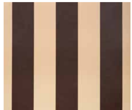
CORK AND SAND/SAND CP-2775 *