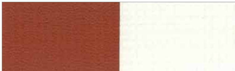
RUST CP-2752 ITEM # 857252