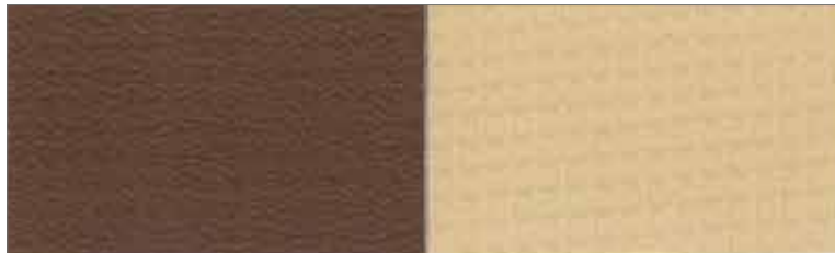
CORK BROWN CP-2750 ITEM # 857250