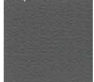
CHARCOAL GRAY CP-2718 ITEM # 857218